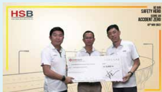
Left: DE113 – Bronze Category Right: T738 – Bronze Category