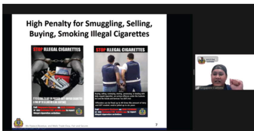
Webinar Session by Singapore Customs

The event was followed by 2 engaging webinars by our guest speakers – National Kidney Foundation (NKF) and Singapore Customs. NKF shared on the 2 leading causes of kidney failure – diabetes and hypertension, and what actions could be taken to improve your lifestyle. Singapore customs shared on laws and regulations and illegal cigarettes, which educated our workers on the tobacco taxes, offences of possessing and selling duty unpaid tobacco products.