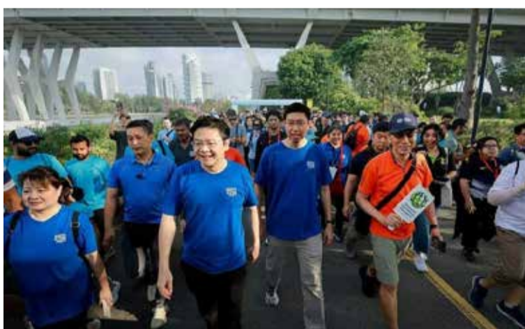
Guest of Honour DPM Lawrence Wong gracing the event

Mr Wong concluded in his speech saying that collective efforts had enabled Singapore to get this far in its Water Story and the Singapore Story.