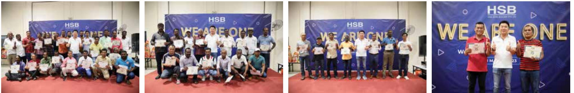
Workers Long Service Award Recipients

Long service awards were presented to 53 workers who reached the milestones of 10th, 15th, 20th, and 25th years of service in HSB. This year, the management continued to reward workers who consistently maintained the cleanliness and tidiness of their rooms.