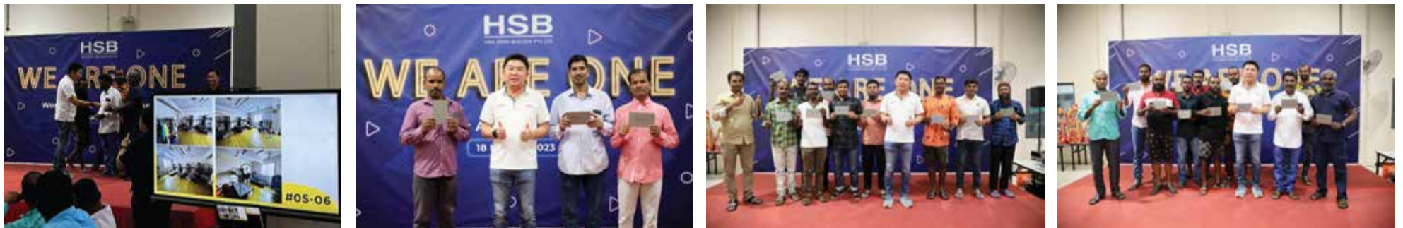
Workers Clean Dormitory Room Competition Award Recipients

Attractive lucky draw and game prizes were won by workers, and interactive and fun games filled the night with laughter and joy. Sumptuous buffet dinner of different cuisines including a live prata station were arranged where all our workers, volunteers and management ate to their hearts content.