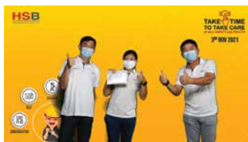
WSH Performance Silver Award presented to EHS Corporate Department