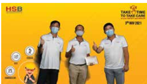
WSH Performance Silver Award presented to EHS Corporate Department