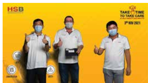
WSH SHARP Award presented to DE113, ER519A, JTC-WFP and RC118

Awards were also presented to workers and supervisors to recognise their excellent EHS Performance. WSHE Day ended with dinner for all staff and workers as well the distribution of goodie bags and beer to our workers. Even though we are unable to gather physically, we are glad that we are still able to have our annual WSHE Day as well as celebrate Deepavali through technology.