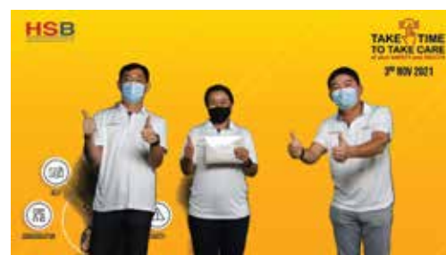
ROSPA Gold Award presented to Corporate and EHS Team