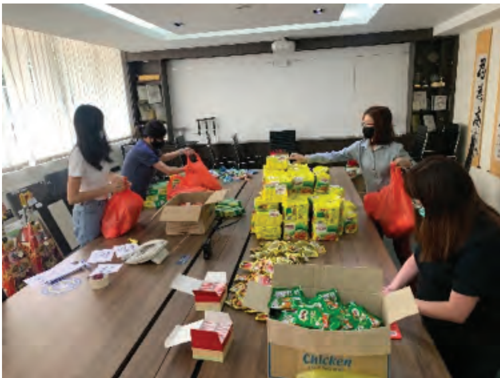
Packing of goodie bag

Our workers deserved a good break after the restart of work since the Circuit Breaker ended. Working tirelessly for the past few months to sustain the company.