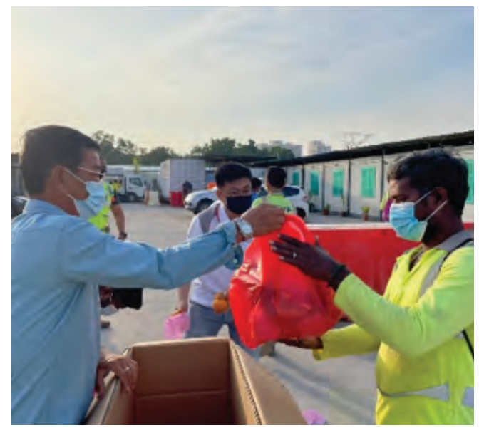
Site Manager distributing Goodie Bags to also our sub-contractors