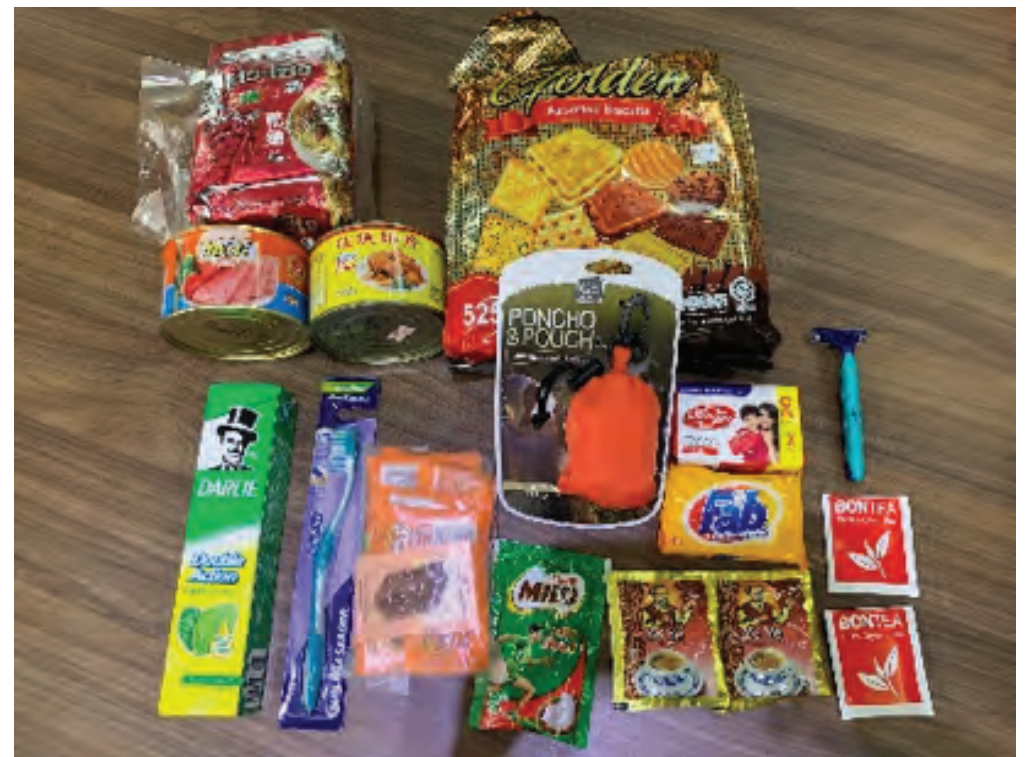
Goodie bag's contents