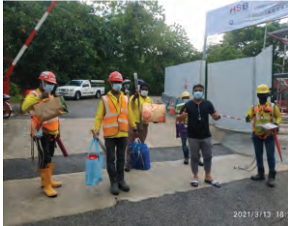
Kind residents of Dairy Farm appreciating our workers with snacks and gifts.

During Chinese New Year, we also had kind residents dropping off goodies and oranges to appreciate our workers. We are thankful that their small action had brought joy and happiness to our workers and project team members.