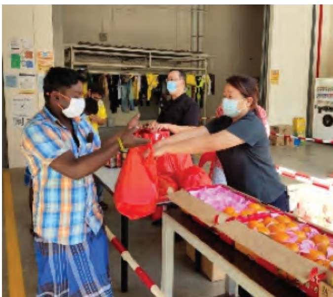
Top management distributing the CNY Goodie Bags and oranges to workers living in Dormitory on the 1st day of CNY