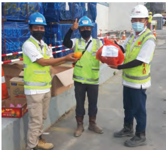
Distributing CNY Goodie Bags to our Chinese employees living in CTQ/TLQ