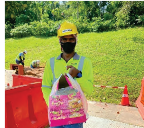
CNY Goodies gifted by residents during CNY after we cleared the pedestrian road after a thunderstorm