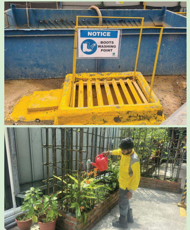
Other Non-potable Uses

Rainwater harvesting is another sustainable practice we have on site for the collection and storage rain from rooftops, reducing our reliance on potable water supply and promoting a more eco-friendly environment.